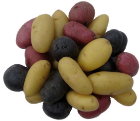
ASSORTED FINGERLING 10, 20 & 50LB

Make St. Patrick's Day delicious & exciting! HEIRLOOM POTATO VARIETIES