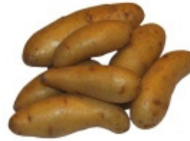
RUSSIAN BANANA FINGERLING 10, 20 & 50LB