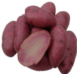
RED THUMB 10, 20 & 50LB