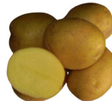
GERMAN BUTTERBALL A,B & C 10, 20 & 50LB