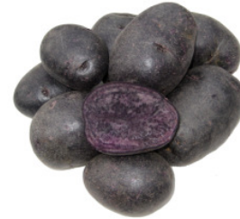
PURPLE A, B & C 50LB