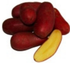
FRENCH FINGERLING 10, 20 & 50LB