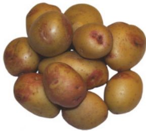
KING EDWARD 50LB