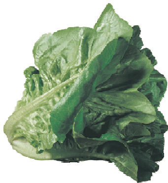
SWEET GEM WHOLE HEADS